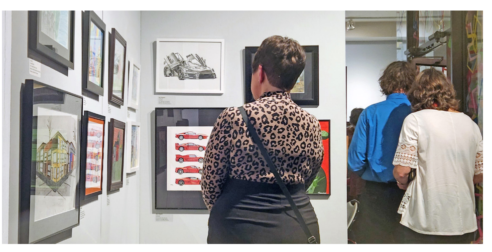
All three galleries at Altoona showcase student artwork for the first time.

SAMA celebrates the area's talented young artists with the Museum's twenty-fifth annual student art exhibition.