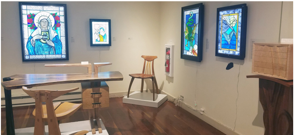
Gallery shot of In Our Elements exhibition.