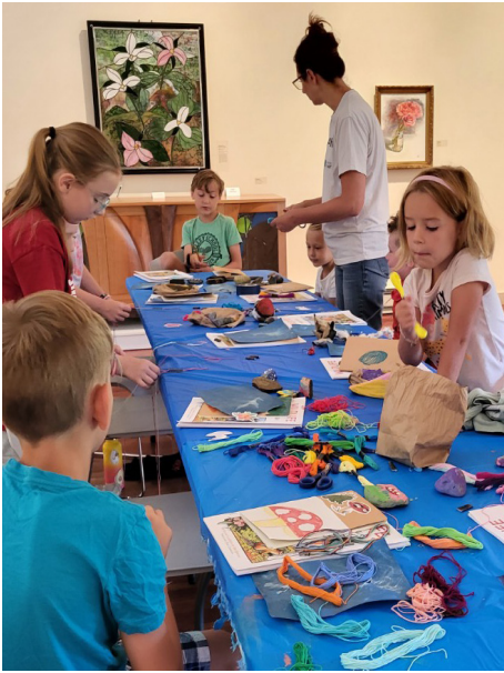
Ligonier art camp was so popular, an extra week was offered to the community.