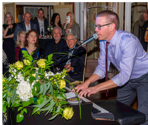
The Flying Ivories at 2022 Dueling Pianos.

Guests are encouraged to embrace the neon theme in their attire, donning their boldest and brightest ensembles. From glowing accessories to neon patterns, the dress code reflects the playful and vibrant spirit of the evening. The core mission of the event is to raise funds