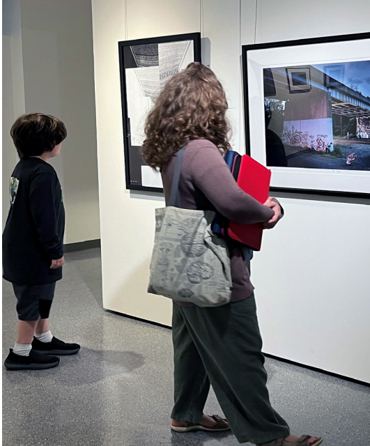
Visitors delight in photographs from this exhibit.