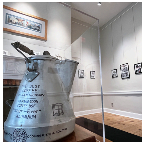
Gallery shot of the 2023 Summer of History exhibition at SAMA Bedford.