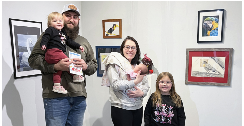
Families visit artworks on display at SAMA Altoona exhibition celebration.

SAMA expands the exhibition to include Johnstown in the Museum's twenty-seventh annual student art exhibition.