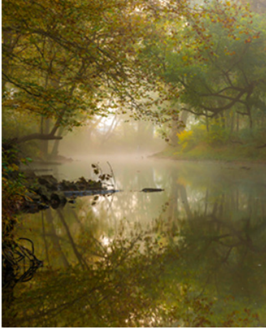
Clare Kaczmarek, "Wormhole", photograph.