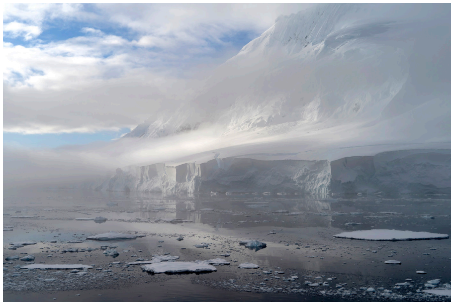
Kelly M. Coursey-Gray, Glacial Mountains in the Mist - 'The Gullet,' Antarctica, 2024, Photograph printed on metal, 24 x 16 in.

Stefanie Boss Cuddle Time, 2023 Digital photography on lustre print, 8 x 10 in.