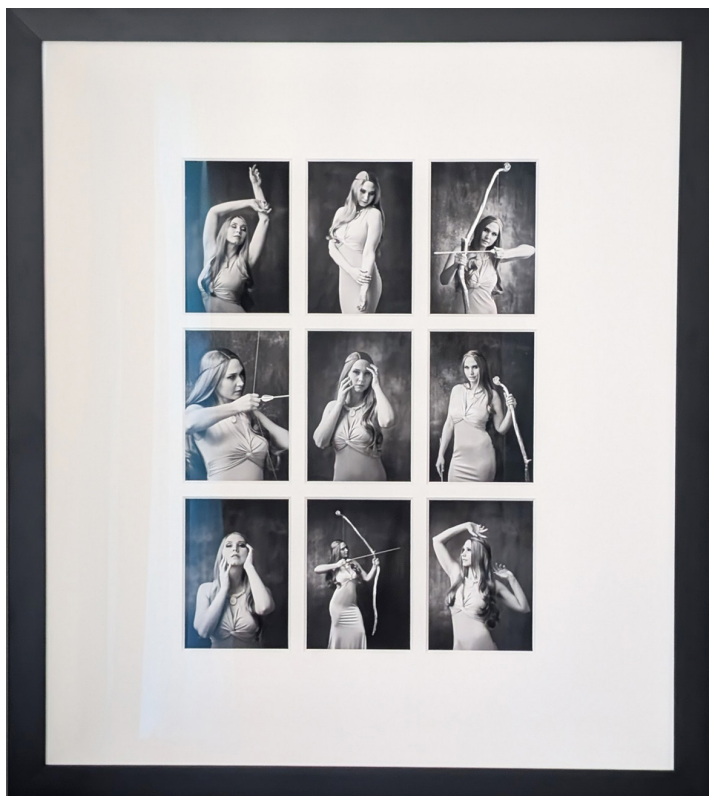
Ally Ramsey, Artemis 9, 2025, HD archival fine print, 34 x 30½ in.

Brian Sesack Near Father Crowley Vista Point, 2022, Archival Black and White Pigment Print, 12 x 24 in.