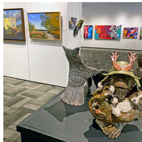
Gallery shot of the 2020 Biennial exhibition at SAMA Loretto.

in a compelling way. Some of the iconic designs were easily recognizable, while others are more obscure, yet each of them speak to the art of poster design. Loretto hosted a virtual film screening series, "SAMA Silver Screen Selections," to celebrate the exhibition.