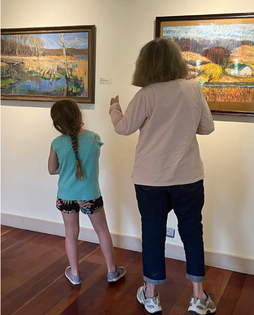
Visitors delight in paintings from this exhibit.