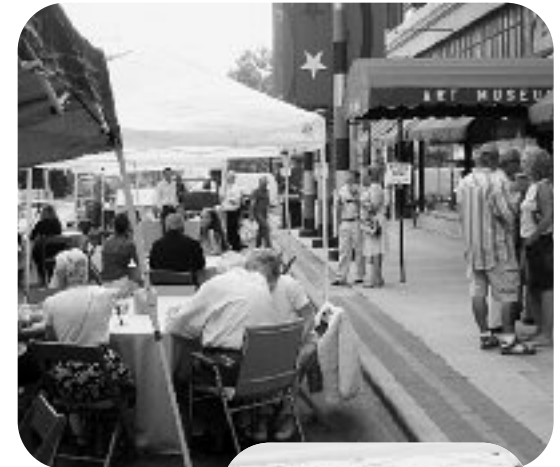
Felix and the Hurricanes played at a special Blue Monday street party at SAMA-Altoona during the summer.