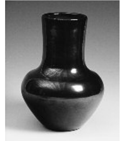
Maria Poveka Martinez Blackware Jar , ca. late 1960s