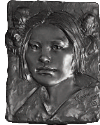
Glenna Goodacre Hopi Maiden , 1990