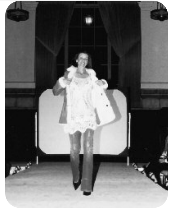
Black & White: The Art of Style featured numerous fashions during the style show, sponsored by Kevin Charles Fine Clothing for Men & Women.