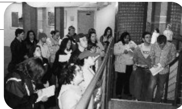
High school students tour the Altoona museum to view the James Mascitelli: Contemporary Conceptualizations exhibition.

There were days when I thought I didn't want to make the effort to get to class because of other things going on in my day. But I would come and within 10-15 minutes of being there I was very happy that I came and left with a very good feeling.