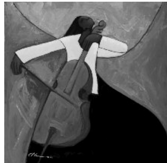
Joseph Holston Cello Concerto, 2002